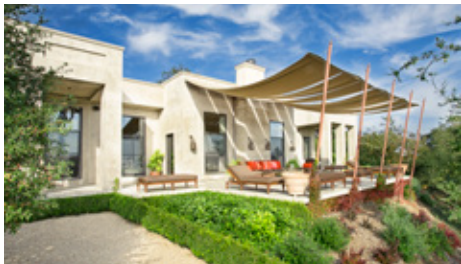
WESTSIDE ROAD, HEALDSBURG | $9,500,000