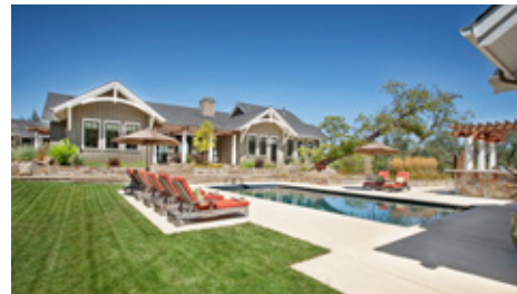
WEST DRY CREEK, HEALDSBURG | $6,750,000