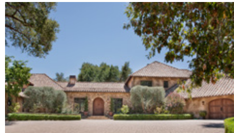
DRY CREEK ROAD, HEALDSBURG | $10,100,000