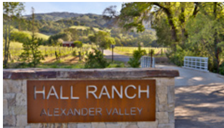
HALL RANCH, GEYSERVILLE | $11,000,000